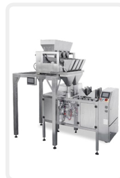
★ Dual Packing Machine+ 4 Heads Weigher