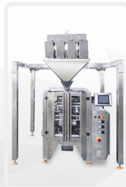
★ VFFS+4 Heads Weigher