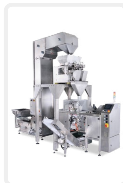
★ Mini Doypack+2Head Weigher