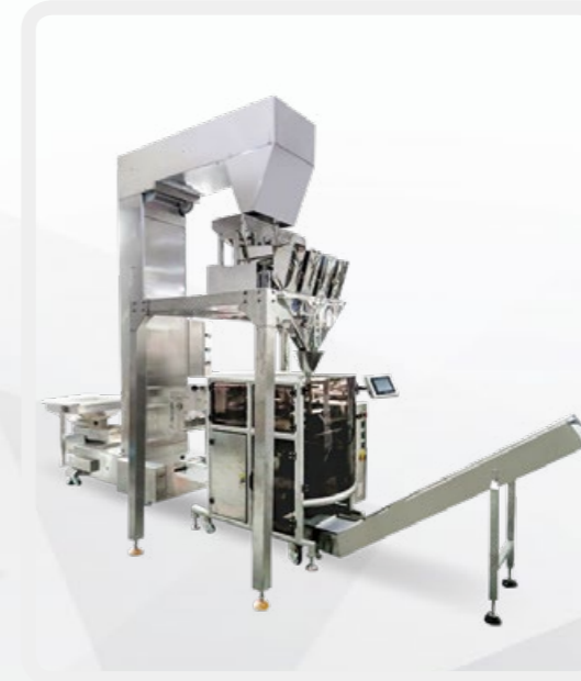
★ Bucket Elevator+Linear Weigher+VFFS +Finish Product Conveyor