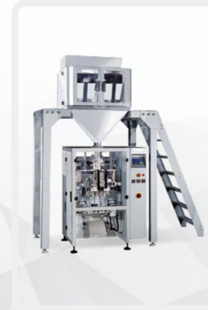
★ MS VFFS+Linear Weigher