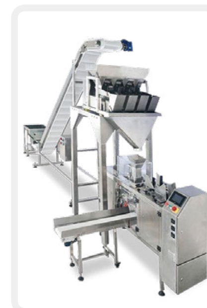
★ Semi Automatic Rice Nuts Grain Seed Beans Granule Weighing Filler Filling Sealing Packing Machine